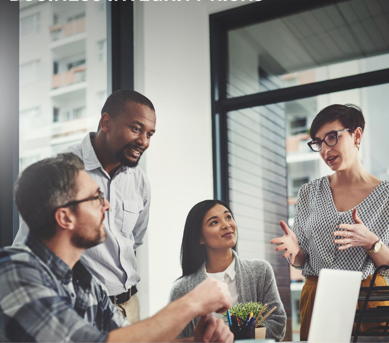
BUSINESS INTEGRITY RISKS COVERED UNDER THIS POLICY INCLUDE 5: