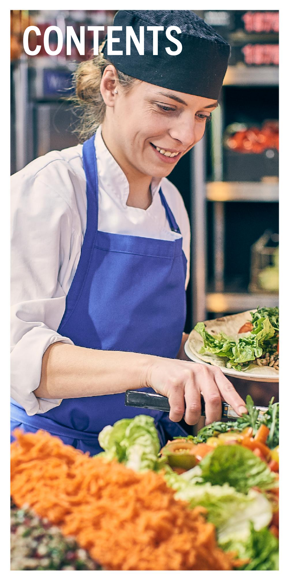
Compliance with this Business Integrity Policy (the policy) is mandatory and should be implemented in conjunction with the Code of Business Conduct. Failure to comply may result in disciplinary action up to and including dismissal. The policy sets out the minimum thresholds and standards that apply across Compass. This does not prevent a country or region applying more stringent thresholds and standards. If there is a difference between this policy, local policy and applicable laws, the strictest requirement must be applied. Where approval is required by Legal and no country Legal exists, you must obtain Regional General Counsel approval.